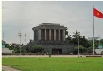
Ho Chi Minh Mausoleum